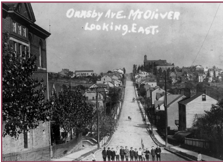
Ormsby Avenue (looking east)