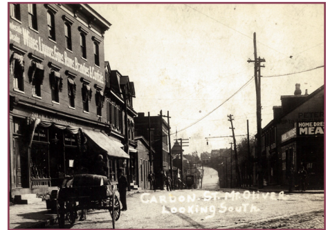
Carbon Street (now Hays, looking south)