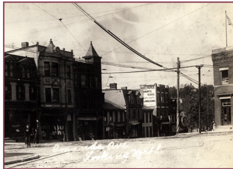
Amanda Avenue (looking north)