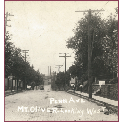
Penn Avenue (looking west)